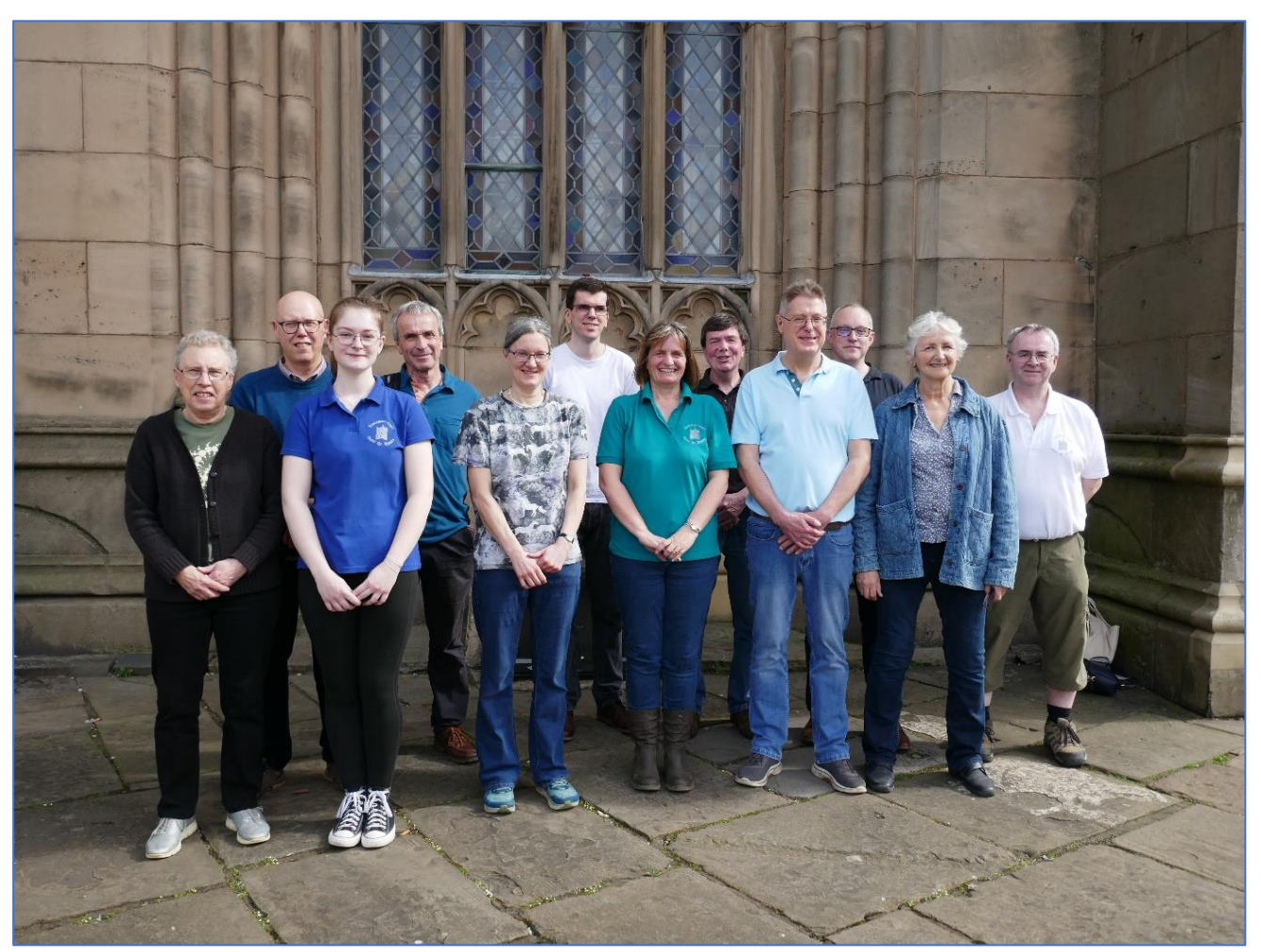
The Cheltenham Band – anticlockwise from bottom right

which certainly focuses the mind – there is no hiding. The atmosphere was so very friendly and it was great to have the opportunity to meet with old friends who were ringing or supporting the other teams. Is it worth the effort? Undoubtedly yes because, as with any striking competition, the practicing and the contest itself, forces you to think about your technique and accuracy, which improves your ringing back in the real world of weekly practicing and Sunday service ringing.