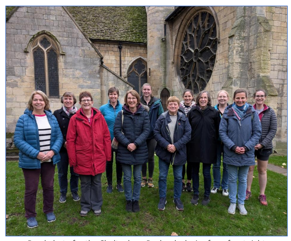
Band photo for the Cheltenham Peal – clockwise from front right

The first peal on 12 by a female band all sharing the same first name